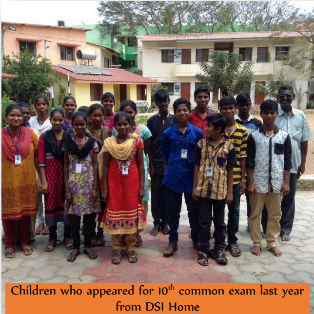
Children who appeared for 10 th common exam last year from DSI Home