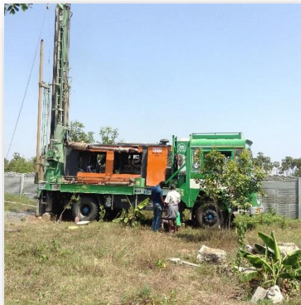
Bore well being dug at the agricultural land