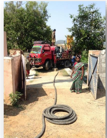
Bore well being dug at the dairy farm