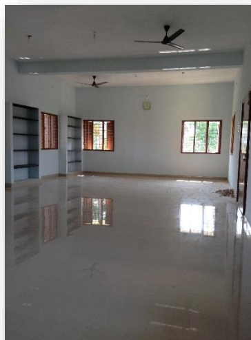
Inside the new Girls dormitory