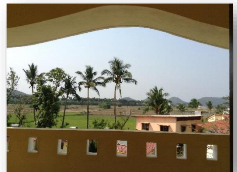
View from the Girls home balcony