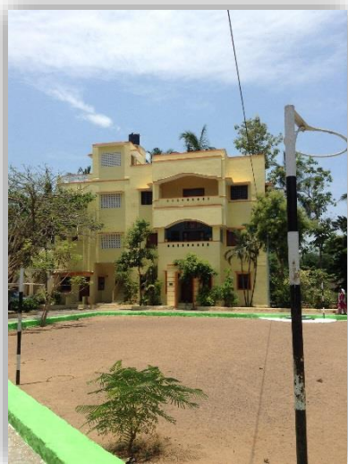
Second floor – new dormitory for Girls

Three bore wells have been erected, one in agricultural land, another in the girls dormitory and another at the cow shed. So we are self-sustainable in terms of water supply during hot weather.