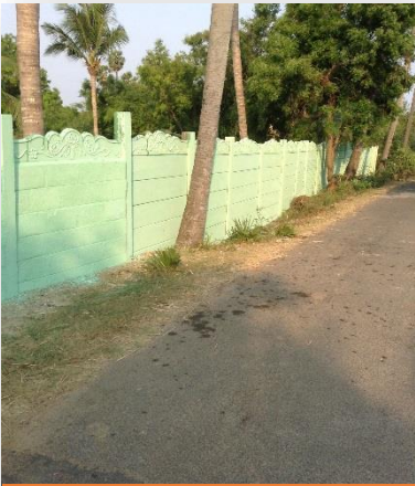
Compound wall being rebuilt and painted around the dairy farm

The compound wall at the dairy farm was rebuilt after the cyclone and repainted.